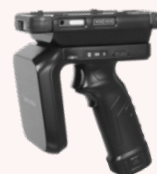
UHF RFID Reader