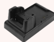
Single Slot Cradle (opt. Ethernet)