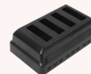
4 Slot Battery Charger